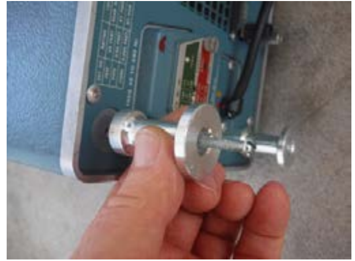
Continued on page 16...