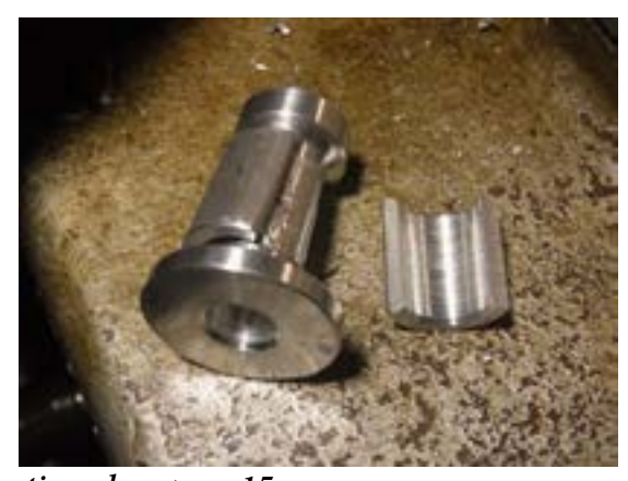
Continued on page 15...

Yes, I had to make four of them using a lathe. Each foot is 1 1/2 inches long. The wide flange at the end is 1 inch in diameter and the small flange at the other end is 3/4 inch in diameter. The main body outside diameter is 1/2 inch in diameter. The order in which you machine a part like this is important; if you don't think it through beforehand you can end up like the perverbial floor painter whom paints himself into a corner - except worse; it usually means you throw out the part and start over. In order to hold the part properly for machining I needed to make a holding tool designed especially to hold the foot. Here it is shown with how it is used to hold the foot: