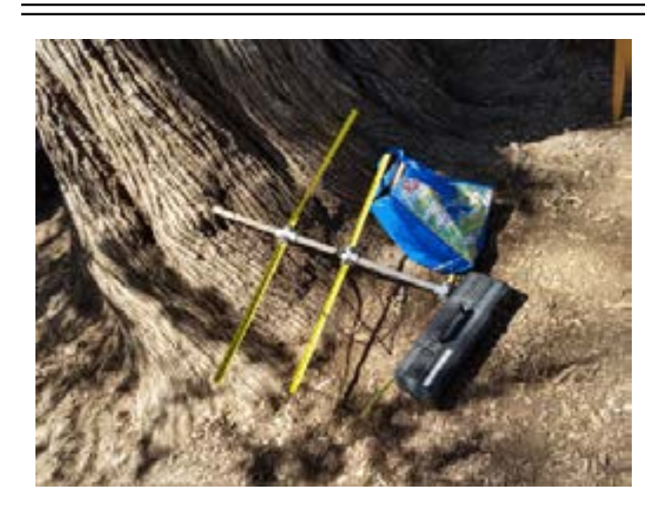
Have to have a Fox Hunt .... It's been caught at this point.

I have found that designing and machining parts conveniently-supports my amateur radio and electronics habits. But not everyone has a machine shop at home. Let me know if you run across the need to modify an existing part or the need for a new part; I may be able to help. My shop machines are not computer-controlled; they're old and used but I can still make some nice parts with them.